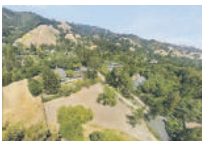
Offered at $4,650,000