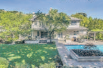
Offered at $2,895,000