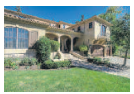
Offered at $3,900,000