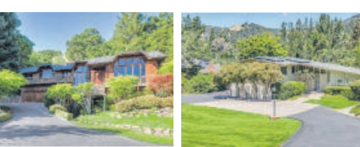
Offered at $1,785,000