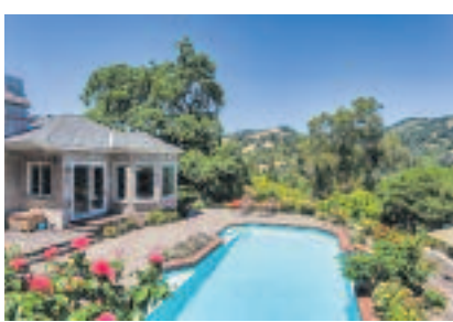
Offered at $2,595,000